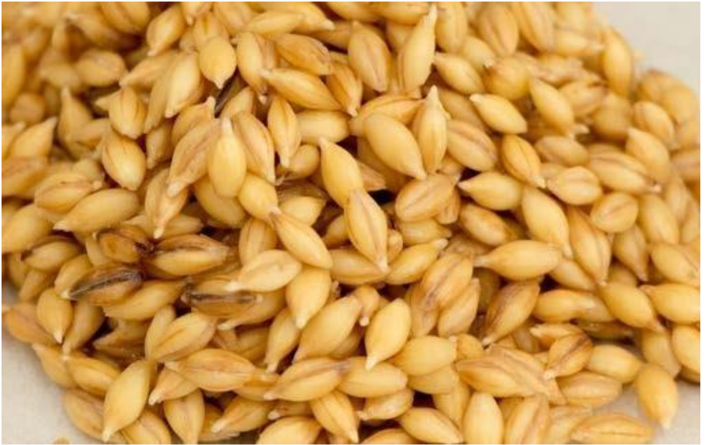
Control Sample Seeds @ 48 Hours