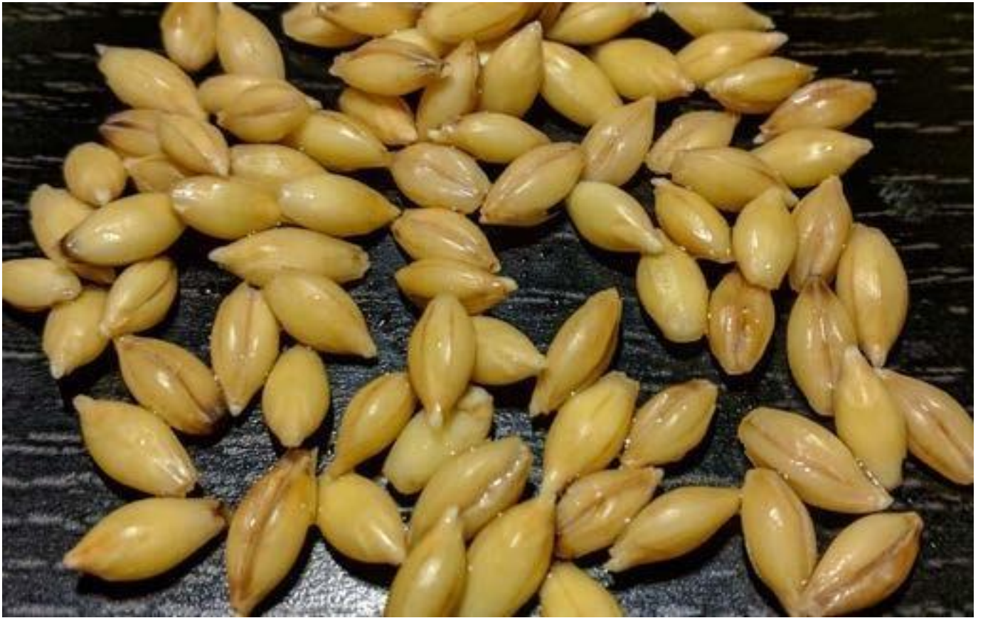
Control Sample Seeds @ 36 Hours